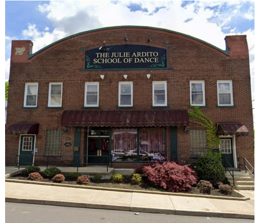
Heavy Practice Location in Old Forge, PA