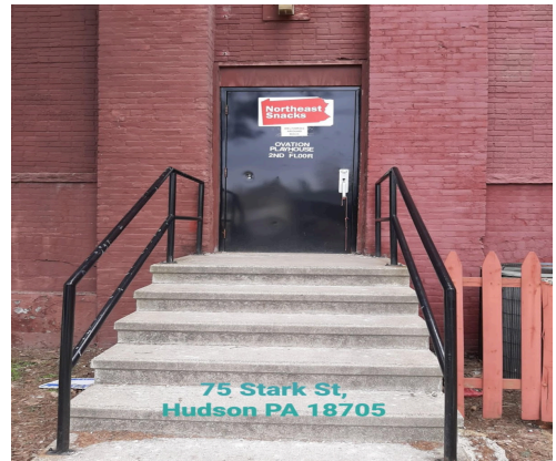
Rapier Practice Location in Hudson, PA

If you have anything you would like to share with the rest of the Barony, please forward it to me at chronicler@endlesshills.aethelmearc.org . Any articles, poems, thoughts, feelings, projects are welcomed! Fellow members of the barony who are receiving an award, please forward to me! Your input is always appreciated and will be added. Any critiques and/or suggestions are also appreciated. Please send to the baronial chronicler email at chronicler@endlesshills.aethelmearc.org . Thanks!